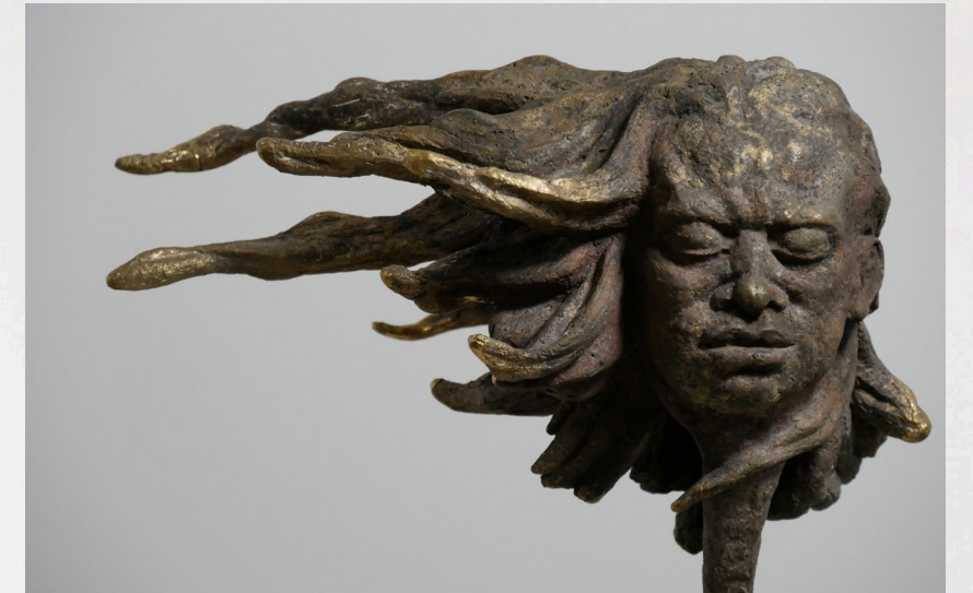
Beaufort 7 Brass . 22 x 26x 20 cm

As a sculptor and physician, I am concerned about the abandonment of humanity. I ultimately want to offer meaning in an increasingly desensitized world. Over the years, my experience in both science and life has taught me that our human choices are infinite - if we let them be. My goal is to capture these moments of choice and ultimately model the infinity of our existence.