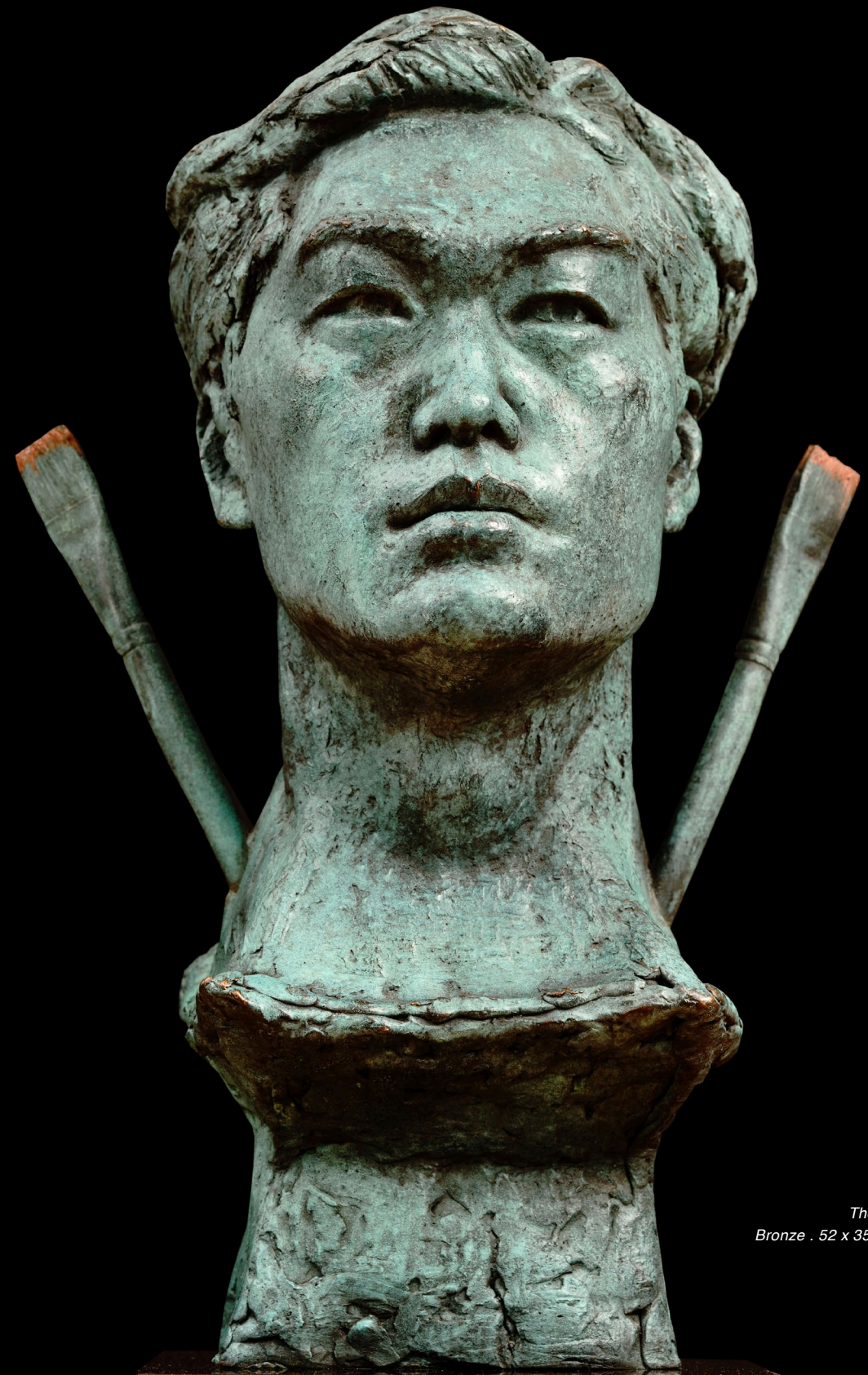
The Painter Bronze . 52 x 35 x 24 cm