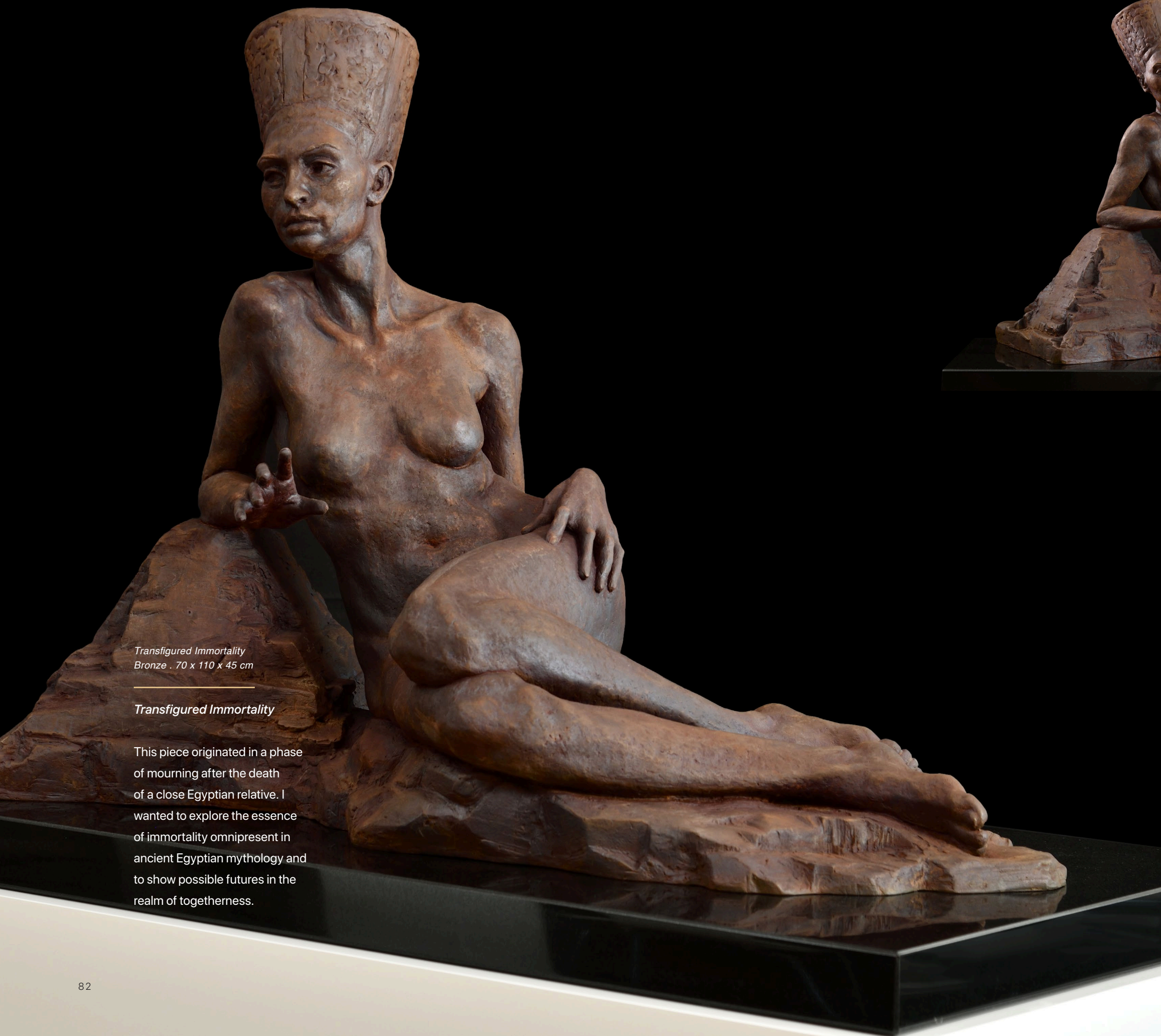
Transfigured Immortality Bronze . 70 x 110 x 45 cm